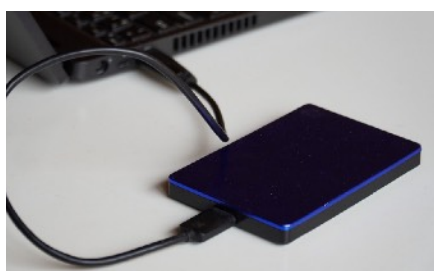
EXTERNAL HARD DRIVE

Another way to store files, is by using an external hard drive . These external hard drives have evolved over time and have become more compact. But unlike flash drives , external hard drives may not always be compatible with other devices like tablets, smart TVs, and similar devices. That's why I tend to use external hard drives for backups.